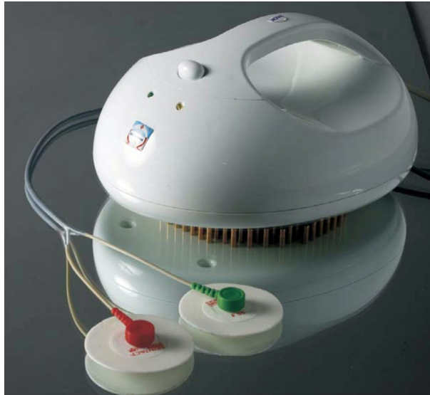
Fig.1. Electrical impedance computer mammograph MEIK

The main feature of electrical computer mammography as opposed to X-ray mammography, NMRI imaging and ultrasound techniques is that weak alternating electric current (50 kHz, 0.5 mA) is used for probing, while the sensors register the distribution of electrical potential caused by the passage of current through the medium under study. Moreover, in the electrical impedance method the source of energy and the registering sensors are positioned in one plane. X-ray tomography suggests the emitter and the receiver to be placed in different planes; they are connected with each other by straight equipotential lines, crossing the visualized volume. In case of electrical impedance mammography the equipotential lines, along which the back data projection is performed, are curved, thus it is possible to perform the topographical visualization while positioning the electrodes on the surface of the body – so that there is no need to cover it around.